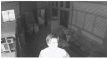
Smart IR OFF