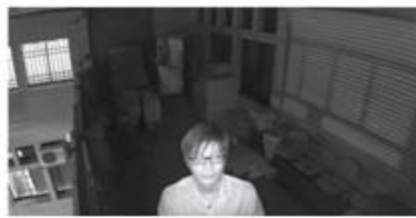
Smart IR ON