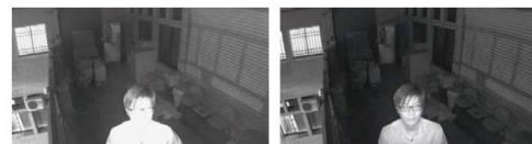
Adaptive IR: Off