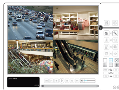
- 4-channel playback